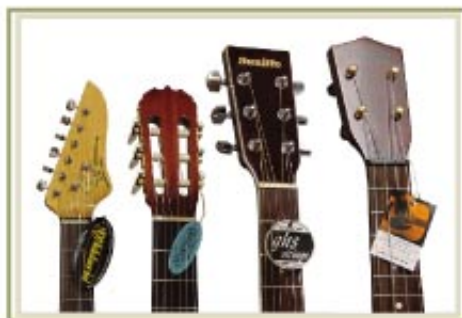
Sunlite selects only the strings that are best suited for each particular instrument as original equipment. Martin®, D'Addario®, GHS®, and D'Aquisto®.