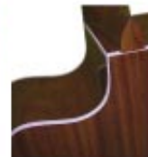
Fully bound body, neck & headstock