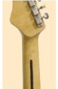
Vintage Tuners and Skunk Stripe