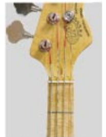
Lightly Figured Maple Necks