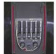
Active Preamp with 4 band EQ and Chorus