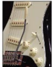
Vintage Tremolo Standard