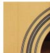
Traditional design inlaid rosette